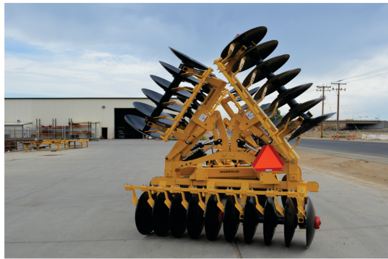
8' LEGAL WIDTH FOR HAULING AND TOWING