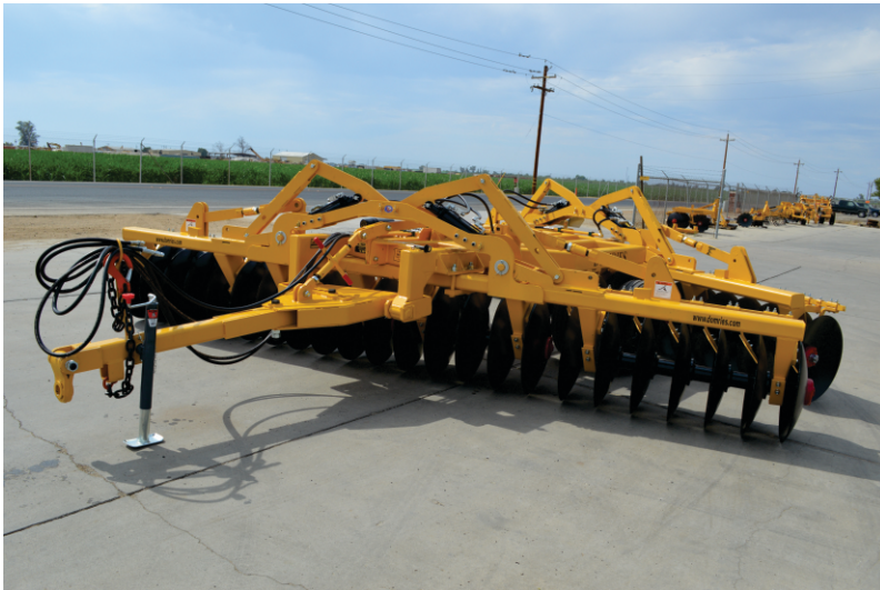
THE BTO-WINGFOLD OFFSET HAS PIN UP, LOCK DOWN WINGS, THAT WILL GIVE A LEVEL FINISHED FIELD.