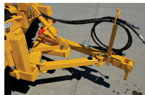
SINGLE TONGUE STANDARD DOUBLE IS OPTIONAL