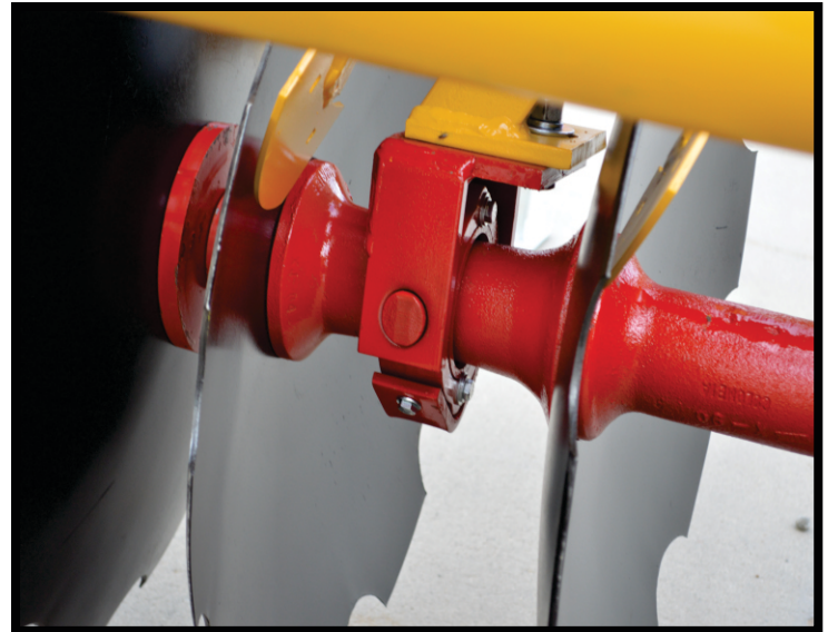
TRUNION TYPE SELF ALIGNING BEARING MOUNTED WITH A RUGGED BRACKET AND CLAMP ASSEMBLY.