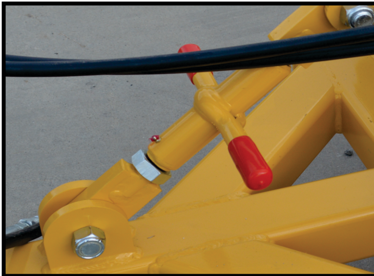
TURNBUCKLE LEVELS THE MACHINE TO THE TRACTOR HITCH.