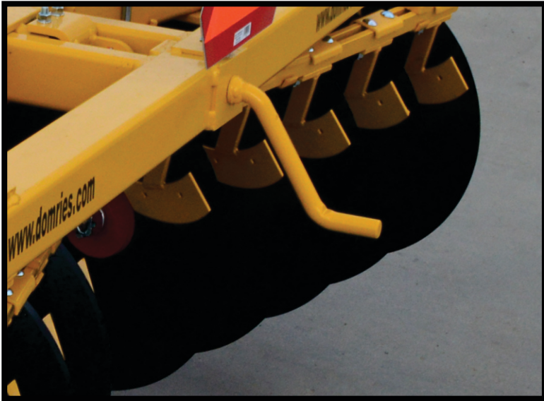
FINE TURN CRANK CONTROL FOR REAR GANGS TO ASSURE A FLAT SMOOTH FINISH.