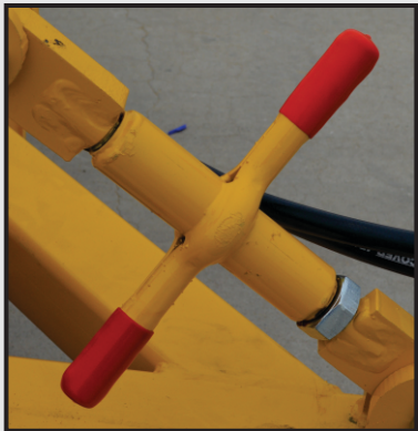
MOUNTED TURNBUCKLE ADJUSTS HITCH TO TRACTOR HEIGHT.