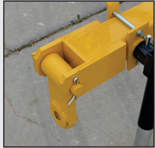
SINGLE TONGUE IS STANDARD DOUBLE LIP AS AN OPTION