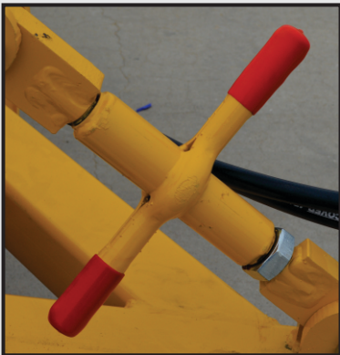
MOUNTED TURNBUCKLE ADJUSTS HITCH TO TRACTOR HEIGHT.