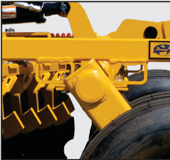
HEAVY DUTY AXEL SHAFT

* see price sheet for notched and smooth combinations