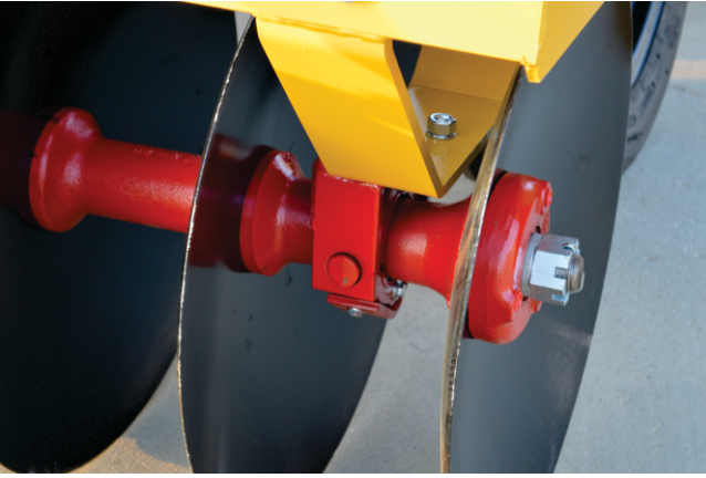
ADD-A-BLADE EXTENSION READY