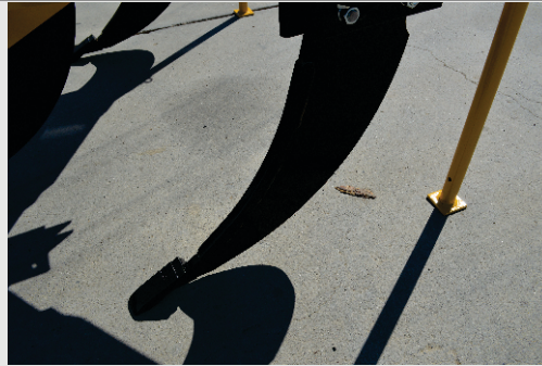
HI TENSILE STEEL REPLACEABLE SHINBAR PROLONGS LIFE OF THE SHANK.