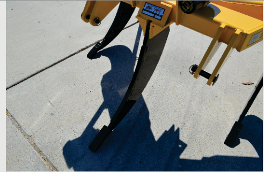
SOLID CENTERPOCKET ACCEPTS 1" SHANKS.