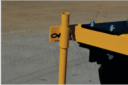
SUPPORT RAILS INSURE SHANK BRACKETS DO NOT LOOSEN OR BEND