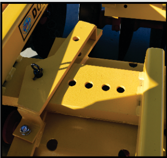
JUST PULL A PIN AND SET

SEE PRICE SHEET FOR NOTCHED AND SMOOTH COMBINATIONS