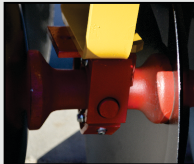
TRUNION BEARING WEAR PLATE AND HEAVY CAST IRON SPACER.